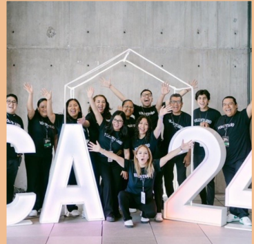
HILLSONG SÃO PAULO