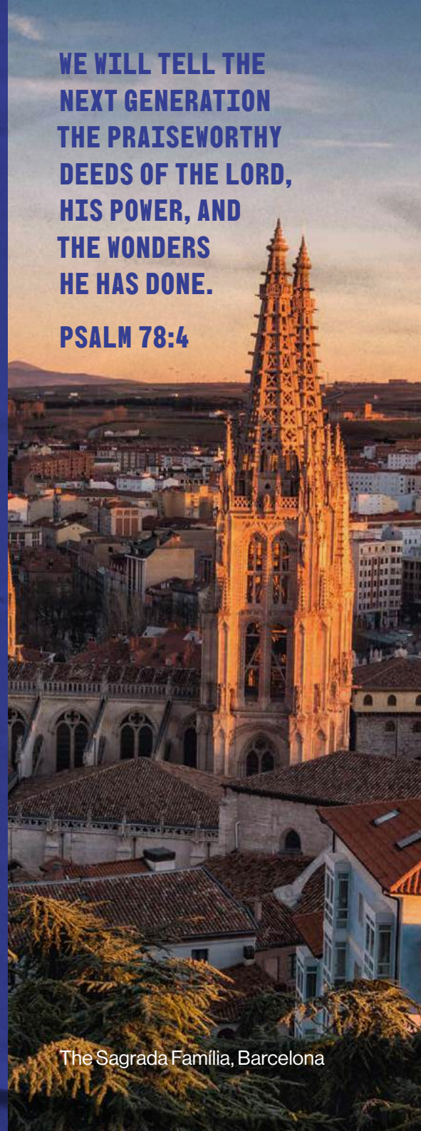
The Sagrada Família, Barcelona